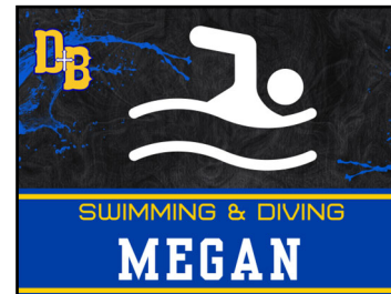
16. Swimming & Diving