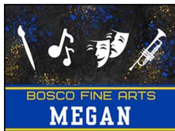
11. Fine Arts